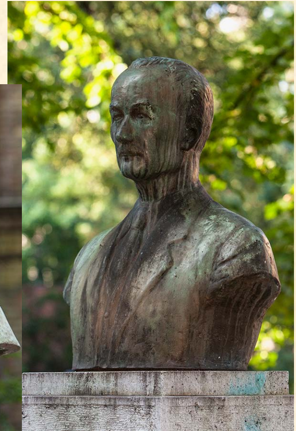
Statutes of professors in the park