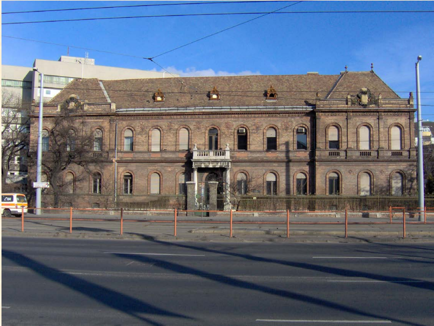
Department of Microbiology and Infectious Diseases 8